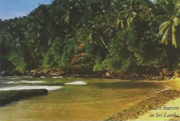
Beach heaven in Sri Lanka

Sri Lanka Real Estate ( www.lankarealestate.com ) has a selection of villas.