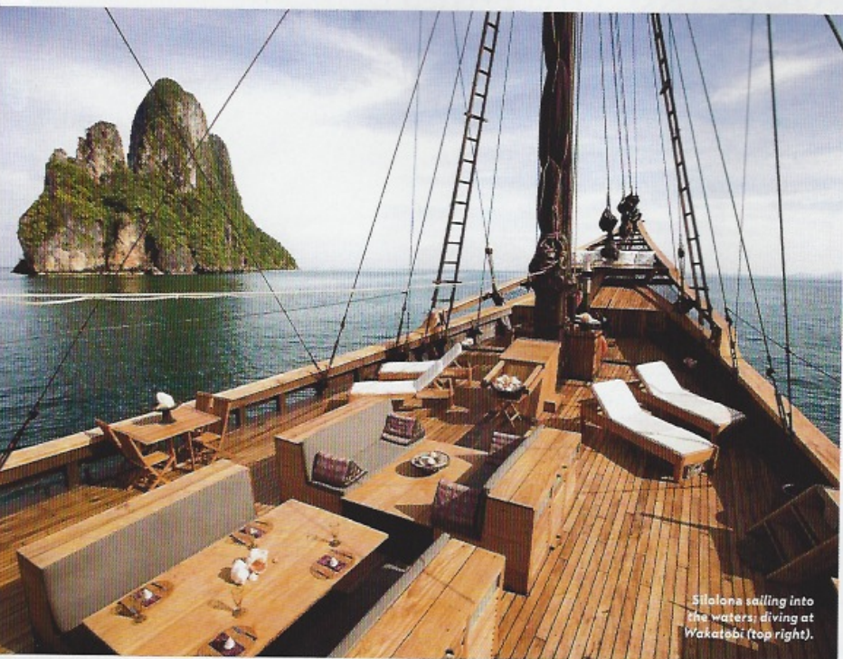
Silolona sailing into the waters; diving at Wakatobi (top right).